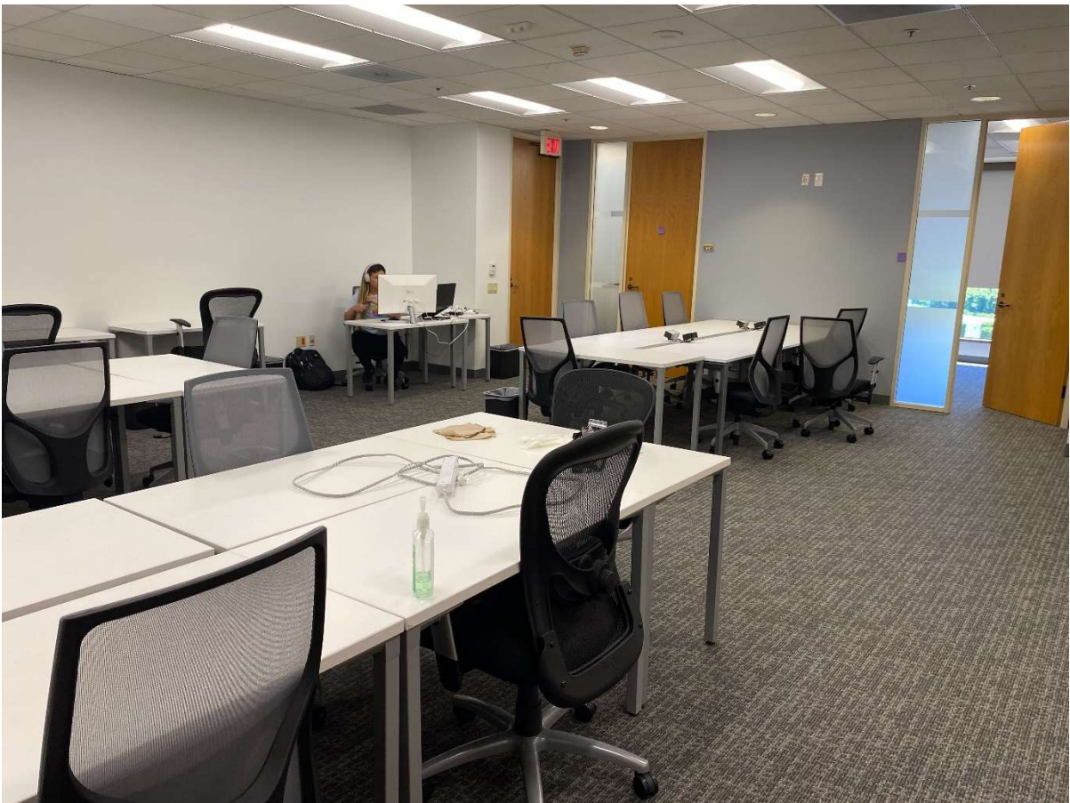
Sabio Classroom No. 417 for Students and Instructors in Irvine