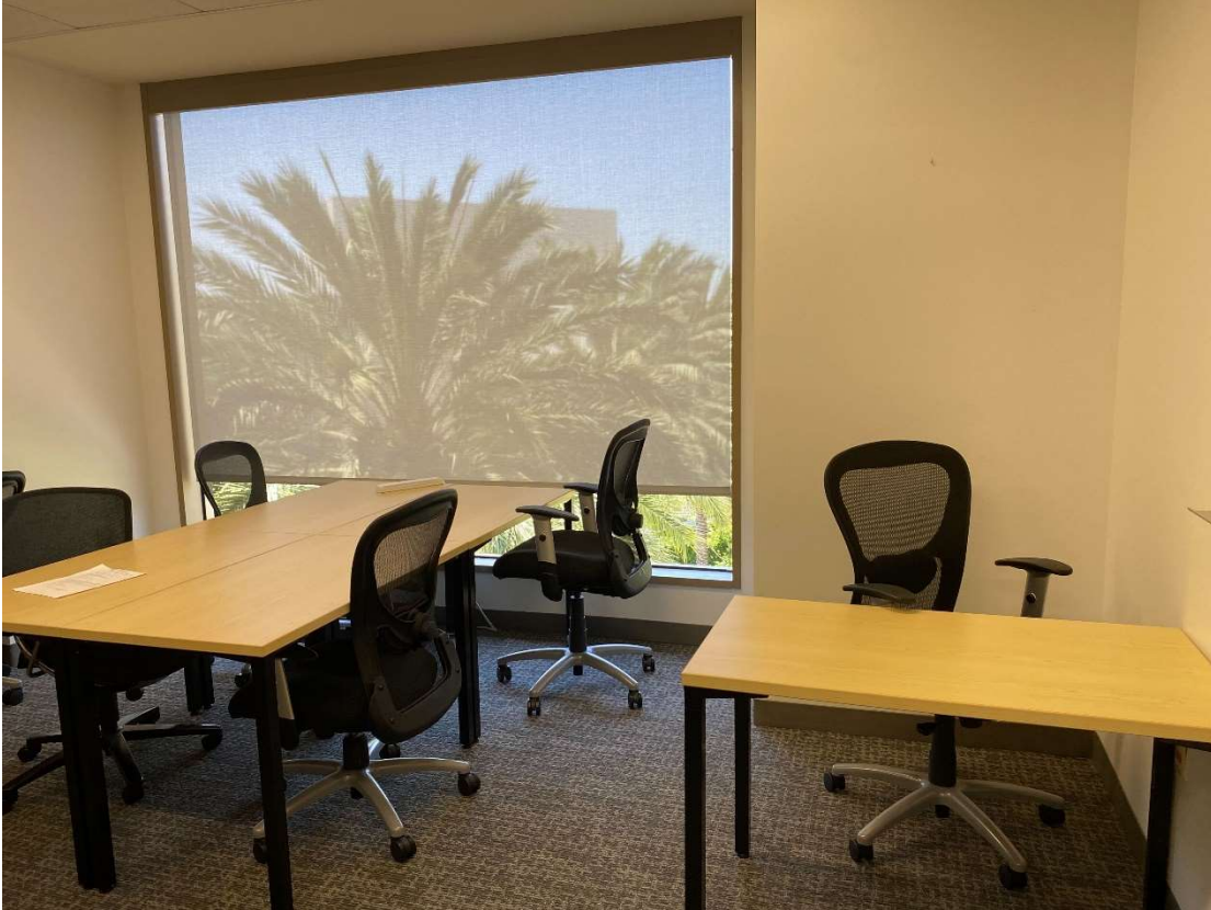
Classroom No. 419 for Students and Instructors in Irvine