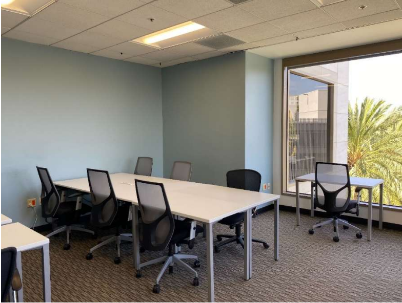
Sabio Classroom No. 447 in Irvine for Students and Instructor