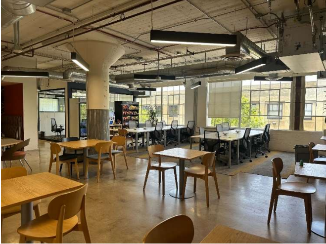
Sabio Downtown Los Angeles Common Area for Quiet Focused Work, Or for Job Interviews