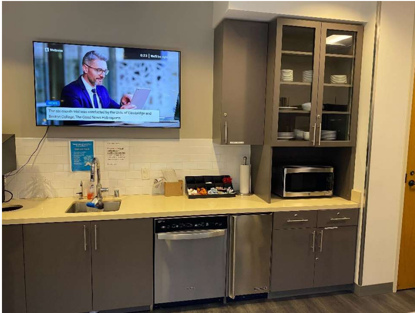
Kitchen with microwave and fridge for all Sabio students and team members