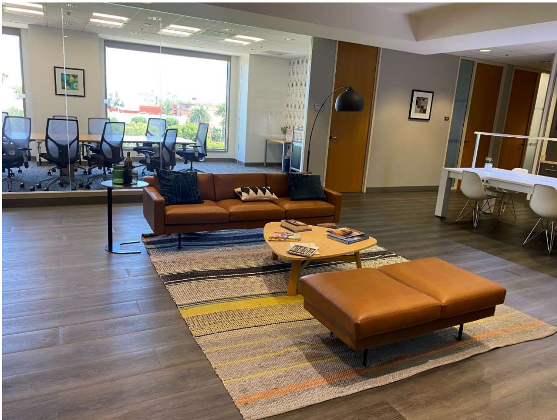
Common area for breaks and lunch