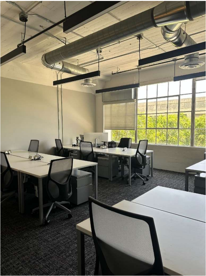
Sabio Downtown LA Classroom 2001 For A Sabio Cohort and Sr. Instructor